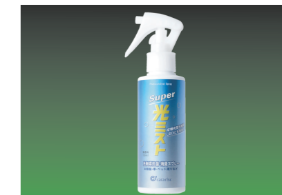
The Hikari Mist series for home