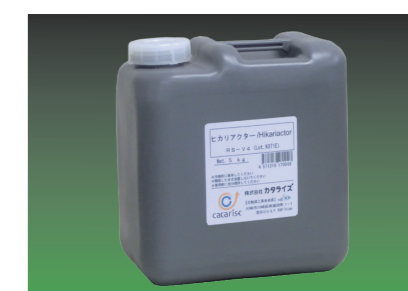
The Hikariactor series for business