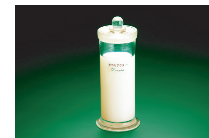
Hikariactor undiluted solution